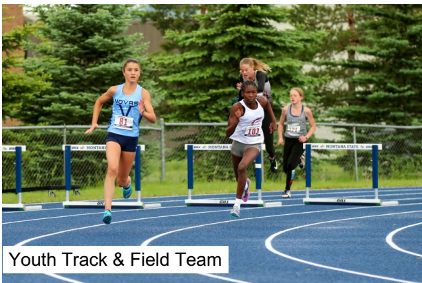
Youth Track & Field Team