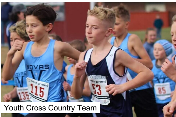
Youth Cross Country Team