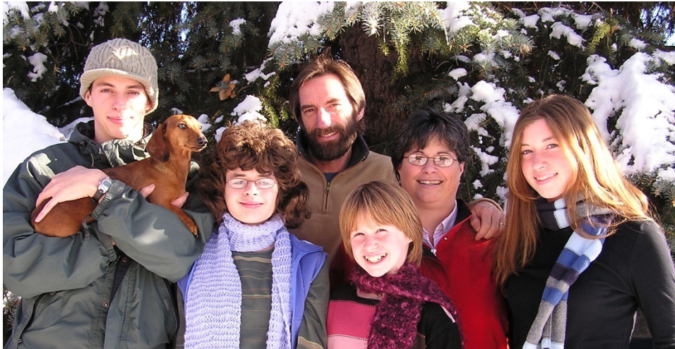
Most of my family .....

10) OTHER INTERESTING TIDBITS: Played High school baseball. Started running in college to get away from the books for awhile. Ran in Converse hightops, thinking that running a mile was a good thing. Spend may field days on streams on East side of Glacier National Park. Enjoy: Hiking, skiing, biking, dark chocolate, photography, anything outdoors, taking naps, trees